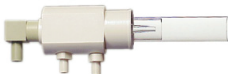
Figure 1. Varian ABC Fully Demountable Torch

• Torch: The presence of metal salts will hasten the devitrification of the quartz outer tube in particular. To lessen the financial impact of deteriorating outer tubes, a fully demountable torch is recommended, in which case the outer tube can be easily replaced without disposing of the whole torch. An example of such a torch is shown below.