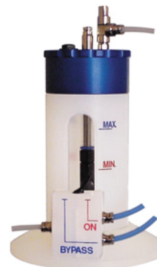
Figure 2. Capricorn Argon Humidifier with Bypass

• Argon Humidifier: Although sample solutions generally do not exceed 2% dissolved solids, many of the metal salts may have a relatively low dissociation constant, and therefore may be prone to salting out at the tip of the nebulizer or injector tube. The Capricorn argon humidifier shown below has a bypass switch which allows you to turn off argon humidification as needed by flipping a switch; there is no need to disconnect lines when humidification is not required.