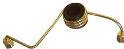
Figure 6. RF Coil for Agilent 7500

Perkin Elmer and other Thermo models. For details on our full range of RF coils, check our website at: www.geicp.com/cgi-bin/site/wrapper.pl?c1=Products_coils