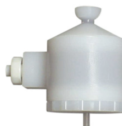
Figure 4. Inert Tracey PFA44 Cyclonic Spray Chamber

• Spray Chamber: An inert Tracey cyclonic spray chamber (shown below) will provide excellent precision and sample transport and yet is unaffected by metal salts and HF. We recommend a PTFE inert chamber for OES applications and a high purity PFA chamber for MS applications.