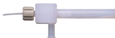
Figure 3. OpalMist Nebulizer

• Injector: An injector tube is needed which will stand up to both the high dissolved solids and the presence of hydrofluoric acid. For this, a wide bore alumina injector is recommended. • Nebulizer: An OpalMist nebulizer shown below is made of inert PFA and is designed to tolerate up to 20% TDS. Since it is also a self-aspirating nebulizer, the pulsations from the peristaltic pump are damped, resulting in tight precision.