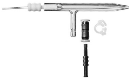
MicroMist Concentric Glass Nebulizer with EzyFit sample connector and EzyLok argon connector.