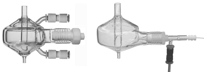
Jacketed Twister and Twister Cyclonic Spray Chambers with Helix Fitting.

Even when using low-flow nebulizers, the solvent load on the plasma may be too great and cause the torch to extinguish. In this case, a jacketed spray chamber (as shown below) and an external chiller are recommended. The purpose of the chiller is to reduce the volatility of the solvent to an acceptable level.